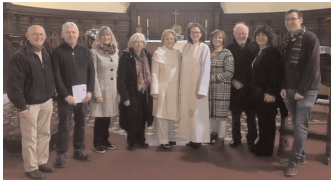
The above group are the Climate Justice Group from Blackpool, the Glen, Ballyvolane who recently visited St. Anne's Shandon to celebrate the joint working group's efforts towards Climate Justice.

All other Masses in the Parishes are the normal times as every weekend.